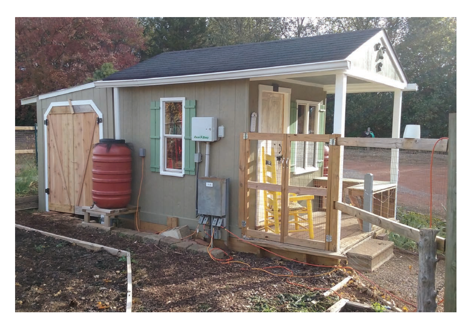
DVG Shed with new on-porch seating.