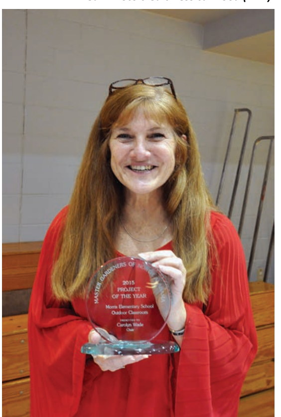
Morris Elementary Project won 2015 Project of the Year.

people. "If there's something that people are interested in, ask! There's nothing wrong with asking. Don't be afraid to suggest something new that we haven't done before."