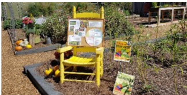
The DVG display before you enter the garden