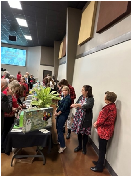
The Silent Auction