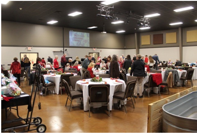
The social time

We closed the program about 8PM after much more socializing and left around 9PM.