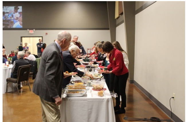
We had such a nice variety of delicious food