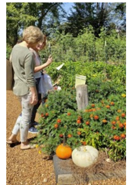
Master Gardeners strolling through the DVG during the Fall Seminar